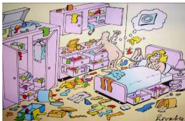
by RONALDO - Brazil