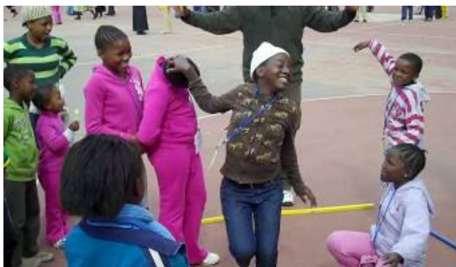
Facilitating What happens in the body with a group of young participants at a community centre.

Some of the artwork displayed inside the bus: